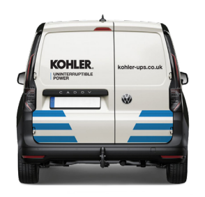
Exceptional 24/7/365 Service Support